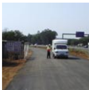
November - December 2003: Completing the perimeter fence and the bulk earthworks, and monitoring traffic from and to the site.