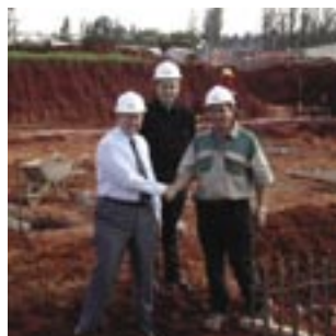
January - February 2004: Erecting the batching plant, pouring concrete and handing the site over to the main contractor.