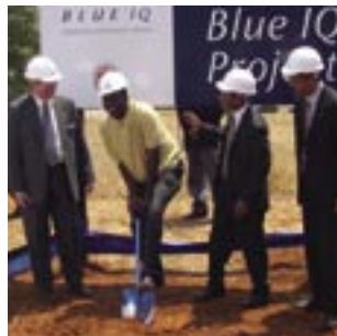
September - October 2003: Clearing and surveying the site, making way for the internal roads, and turning the soil.