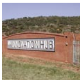
March 2004: Preparing columns for the first levels of the core and Sappi buildings, and the name goes up on the perimeter wall.

Visit www.theinnovationhub.com to view current construction progress.